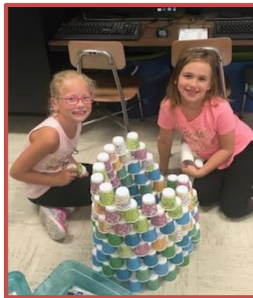
Enjoying Flashlight Friday!

Students take on the paper cup challenge!